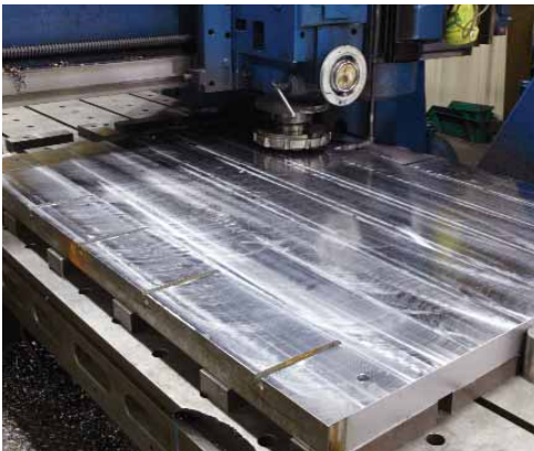
Achieve close tolerance, flatness and parallelism through surface milling for parts up to 168" wide x 264" long.