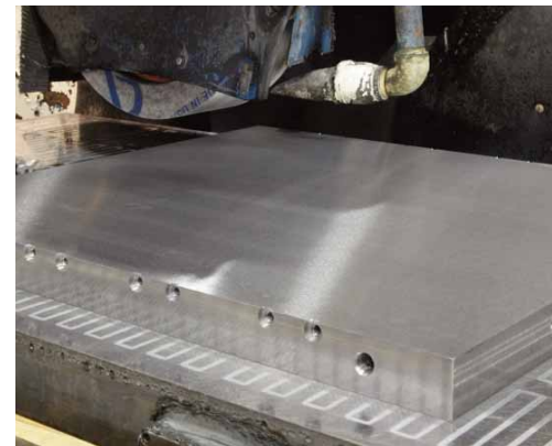
Horizontal surface grinding maintains precision ground finishes on parts up to 10' long.