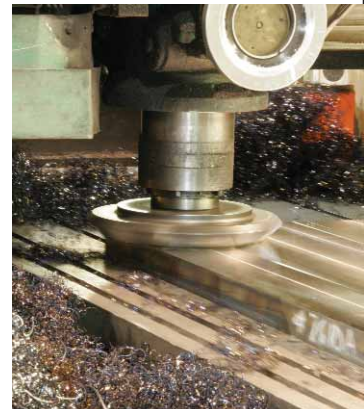
12" cutter allows fine blends to achieve close flatness and parallelism tolerances.