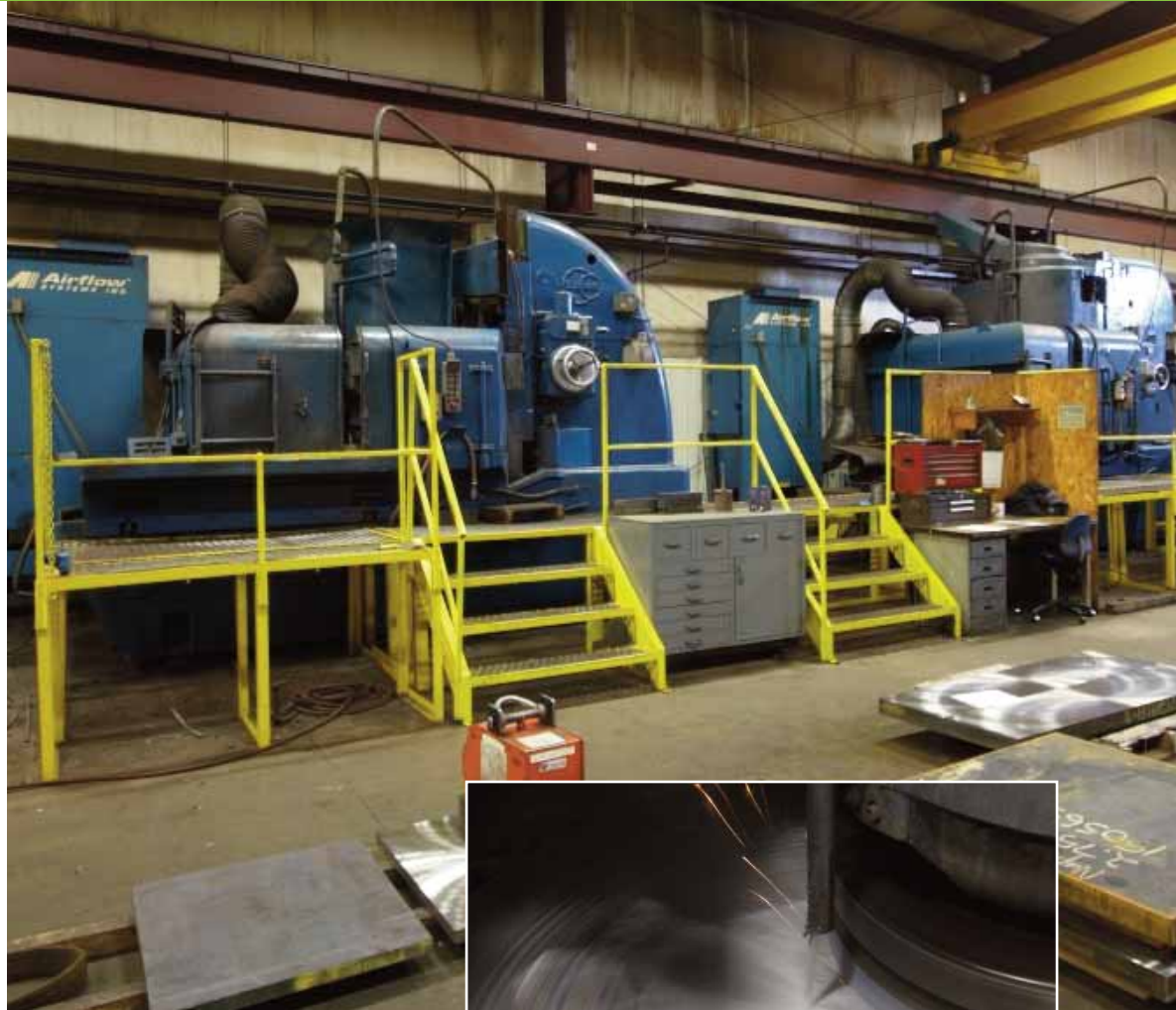
Blanchard Grinding High horsepower rotary grinders quickly and efficiently remove large amounts of stock.