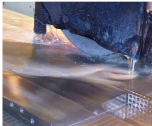
Surface grinding provides a precision surface finish while maintaining superior flatness to close tolerances.