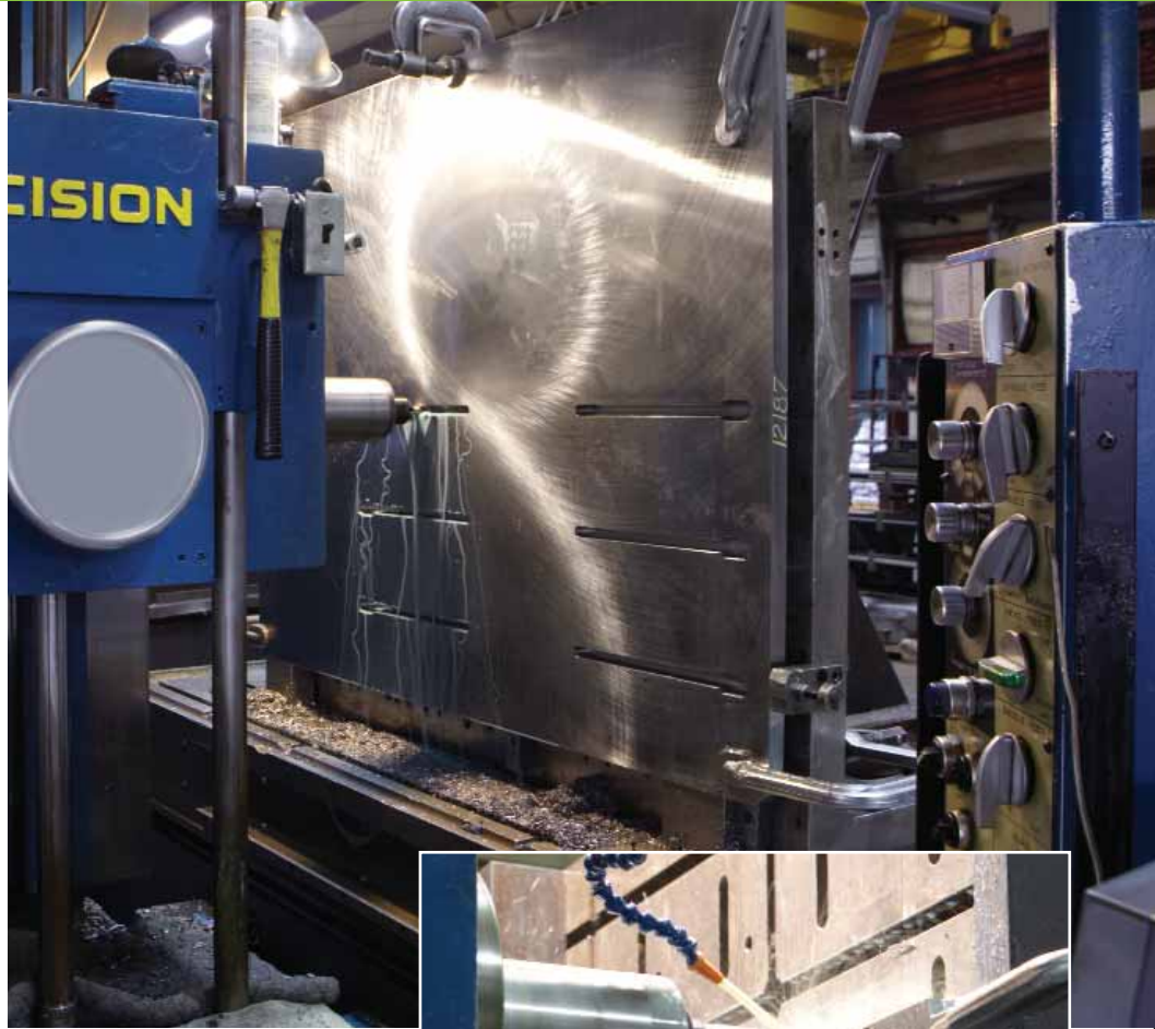
Horizontal Milling This horizontal ground boring machine is creating a series of slots in a large steel part.